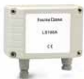
LS160A RH% probe, scale range from 0 to 100 %RH